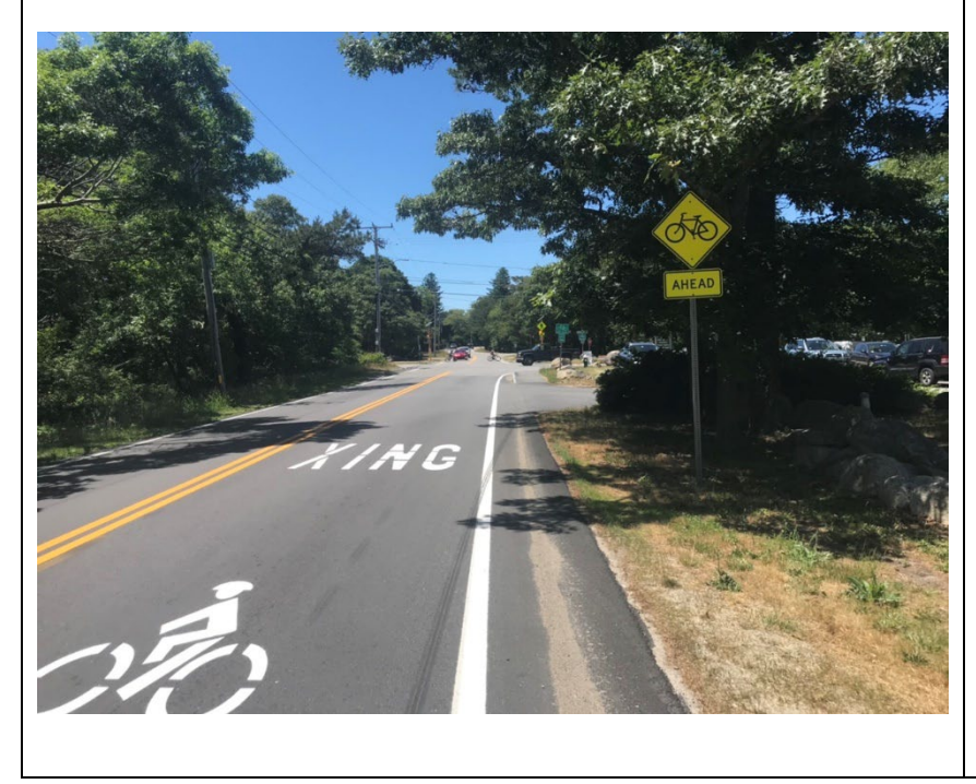
Figure 126: View of Trail Crossing at Long Pond Road. Stamped Brick Helps Draw Attention to Crossing, Along with RRBSs

Figure 125: Image of the Road Approach to the Trail Crossing with High Quality Road Markings and Bike Trail Crossing Sign (RRFB in Distance)